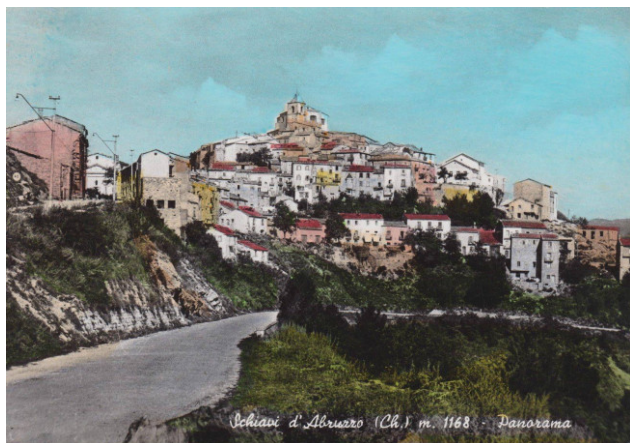
Schiavi d'Abruzzo (Ch.) m. 1168 - Panorama